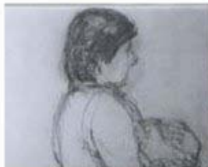
Nose Man with no Moustache