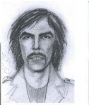
Monster Man with Facial Hair