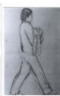
Sketch 1: "Nose Man"