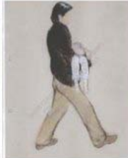
Sketch 2 "Bundleman"